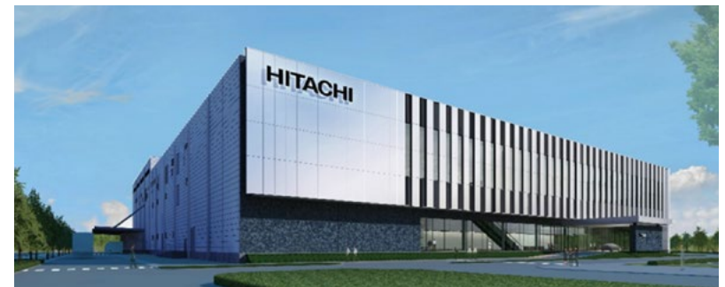
New manufacturing building at Hitachi High-Tech's Kasado Area (image of completion)