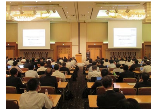
Business partner briefing (Naka Area)