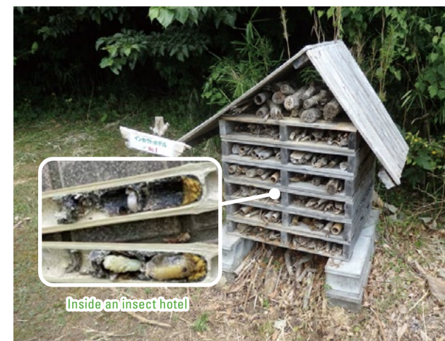
Inside an insect hotel