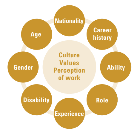
Concept of diversity

We are also working to create an environment in which all employees can be self-directed in choosing the time and location of their work as their life stages change, by reducing long working hours, working remotely from home or using satellite offices, and adopting a flextime system. We are also working to foster an inclusive corporate culture and create a company that maximizes the diversity of its human capital. Initiatives in this regard include opportunities for dialogue on the elements of diversity such as gender race, nationality, ethnicity, cultural diversity and generational diversity; seminars on psychological safety; and grass roots activities by the Employee Resource Group (ERG). With DEI at the core of our management, we will continue to view physical and internal differences as identities of an individual and actively work to create a culture and enhance systems that allow all employees to fully demonstrate their unique abilities.